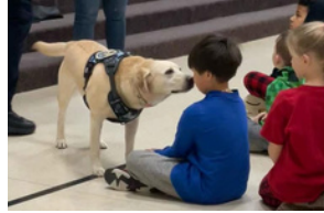
Raider here, sending a warm greeting!