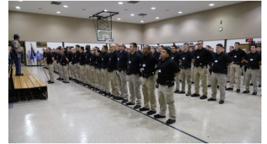
The Indiana Law Enforcement