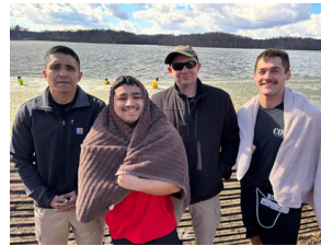
Polar Plunge 2025